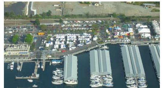
Ariel view of the Edmonds Yacht Club and the Port of Edmonds Marina taken during the 2004 Rotary Waterfront Festival

The festival is by far the club's most important fund-raising activity. It produces the funds which allow the